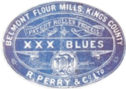
Belmont Mills. TT3005GS

banelibrary@offalycoco.ie. Telephone: 0906454259