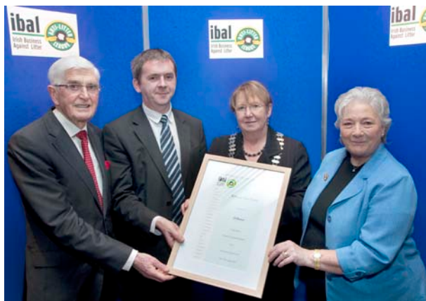
Pictured at the 2010 IBAL Award Ceremony from L to R are :-

and 9 th in 2010 and is now classified as 'Clean to European Norm' standard. Future community partnerships will be build on this successful model.