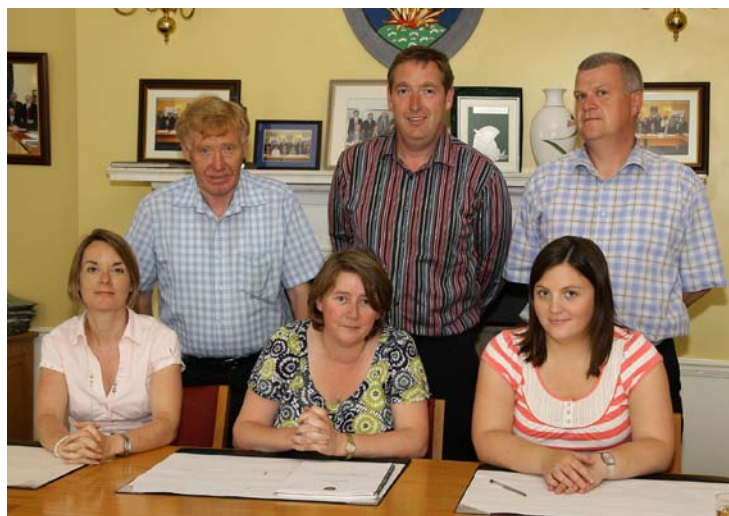
Tullamore IBAL Inter-Agency Group

In 2009, the Council set up a local Inter-Agency group to focus on improving Tullamore’s position in this annual litter league as the town’s lack of progression between 2003 and 2008 was a matter of grave concern to the community at large. The group included representatives of the Tidy Towns, Chamber of Commerce, Offaly County Council and Waterways Ireland.