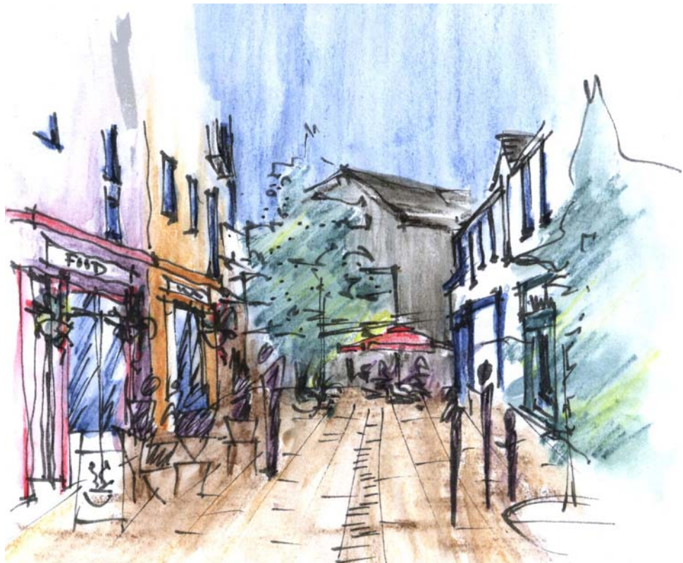
An example of a new development designed with the historic grain

The establishment of clear urban grain of blocks and plots is essential to creating mixed use and singular use spaces of quality and interest. The functional requirements for many new uses such as large shopping centres and office blocks tend to work against the historic and established grain. The key determinant in achieving variety and life on streets will be to strike a reasonable balance between a range of development site sizes and provide for adequate permeability through the urban fabric – thus creating streetscapes.