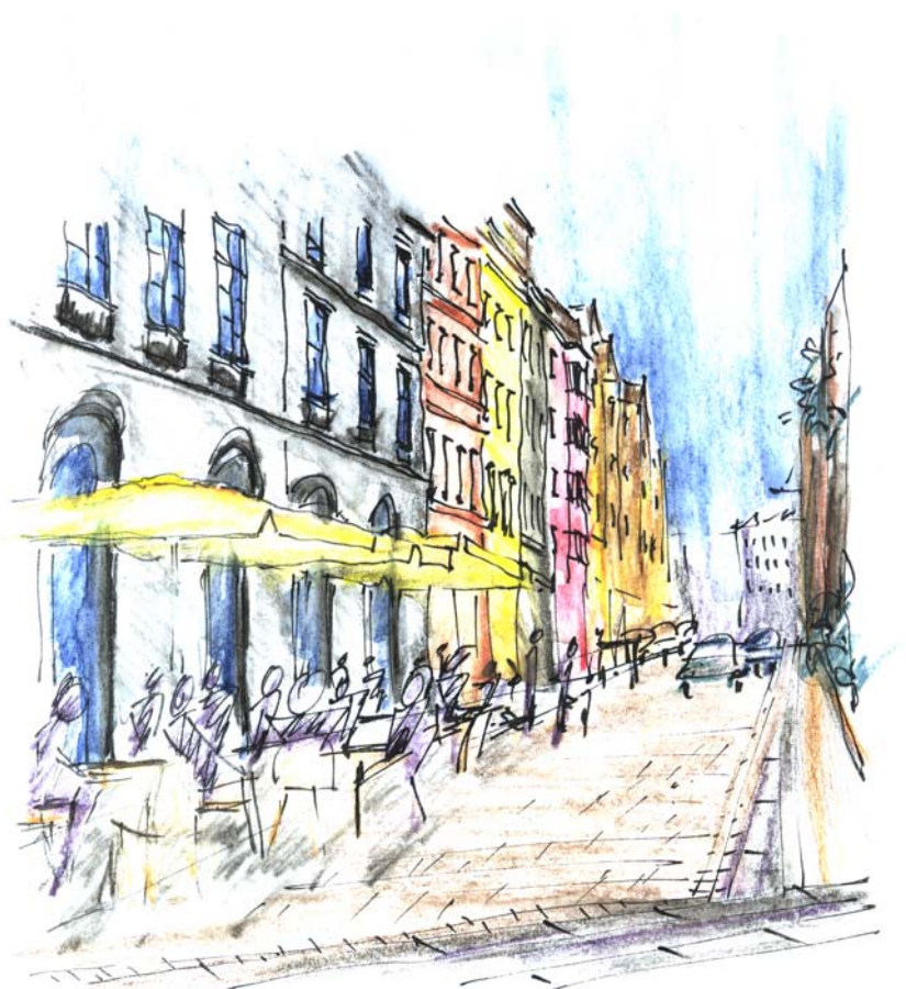
Shared surface – pedestrians and cars