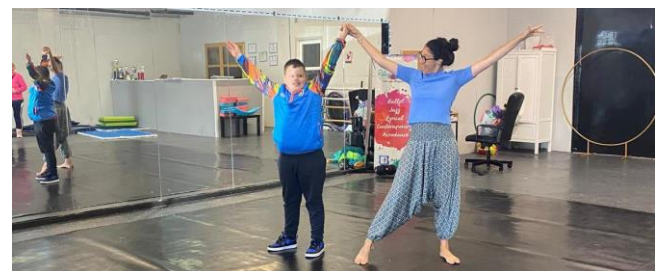
'Step it Up' class Edenderry