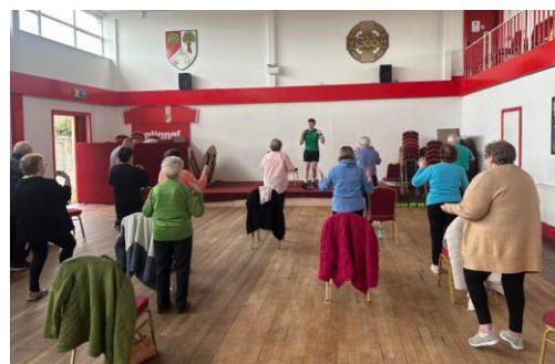
Participants at 'Exercise your way to wellness' class Edenderry

We are delighted to report positive findings for the second year running. Huge credit must go to the implementing partners for delivering on stated aims and we are very grateful to our partners and Edufit for gathering the data and compiling the results.