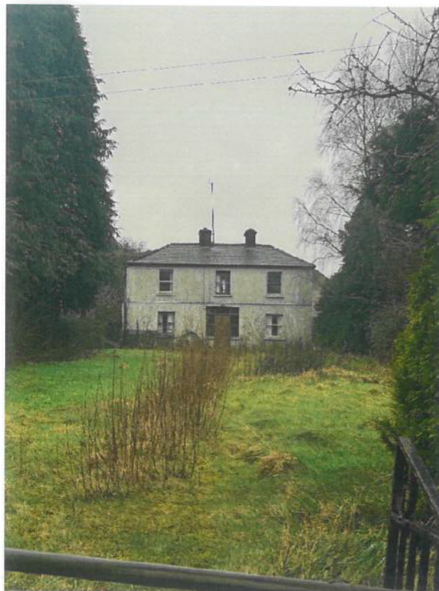
1. Subject Site

The dwelling is located in a Rural Area. The site is located off a private lane, with farmland and agricultural buildings surrounding the site.