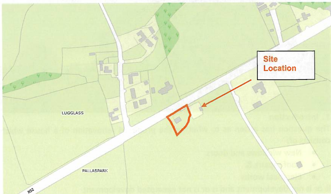
Figs 2: Site Location