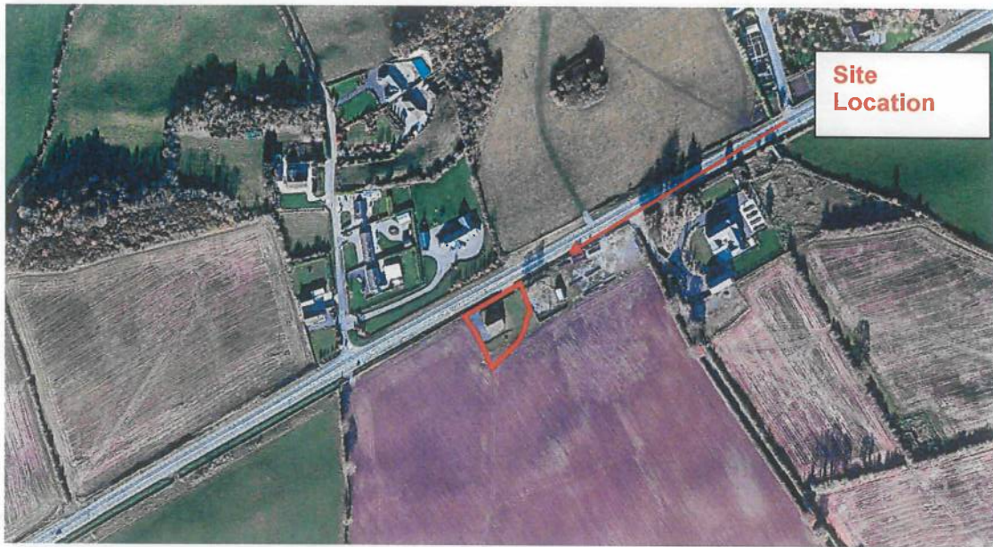
Figs 3: Aerial image of location of site