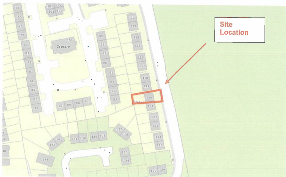
Figs 2: Site Location