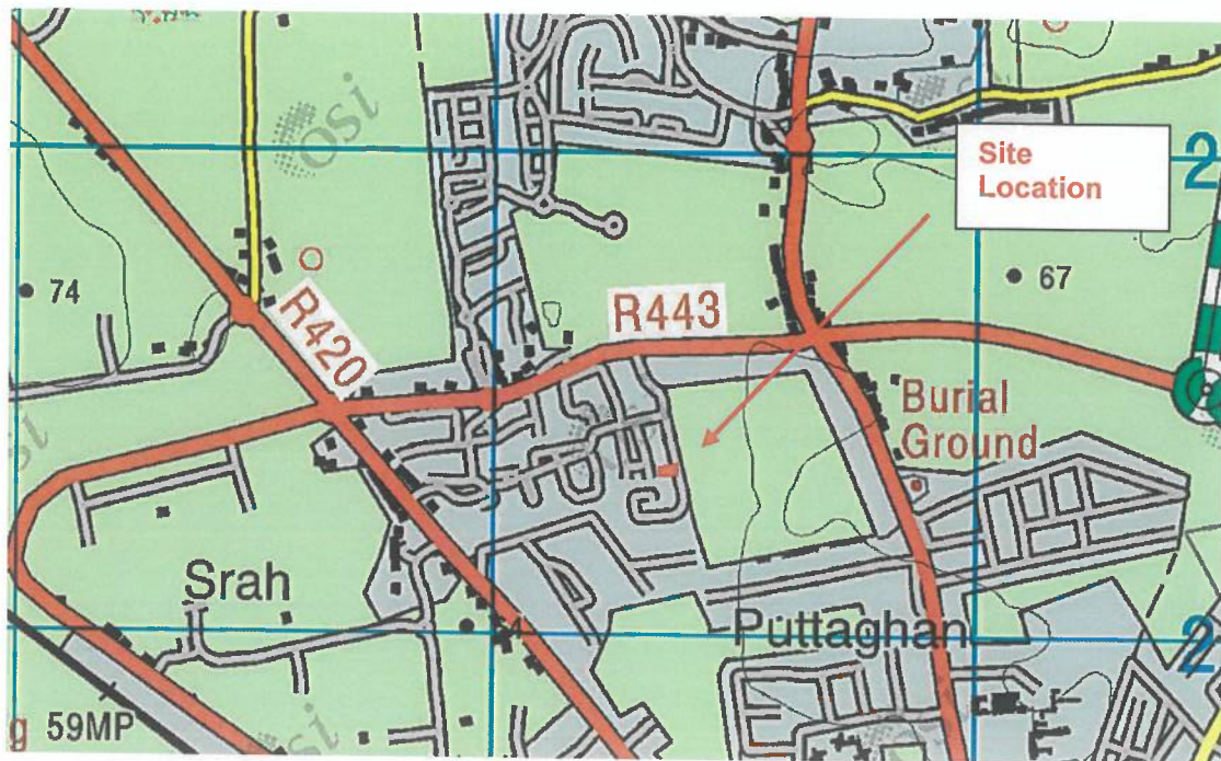
Figs 1: Site Location (Discovery Series)