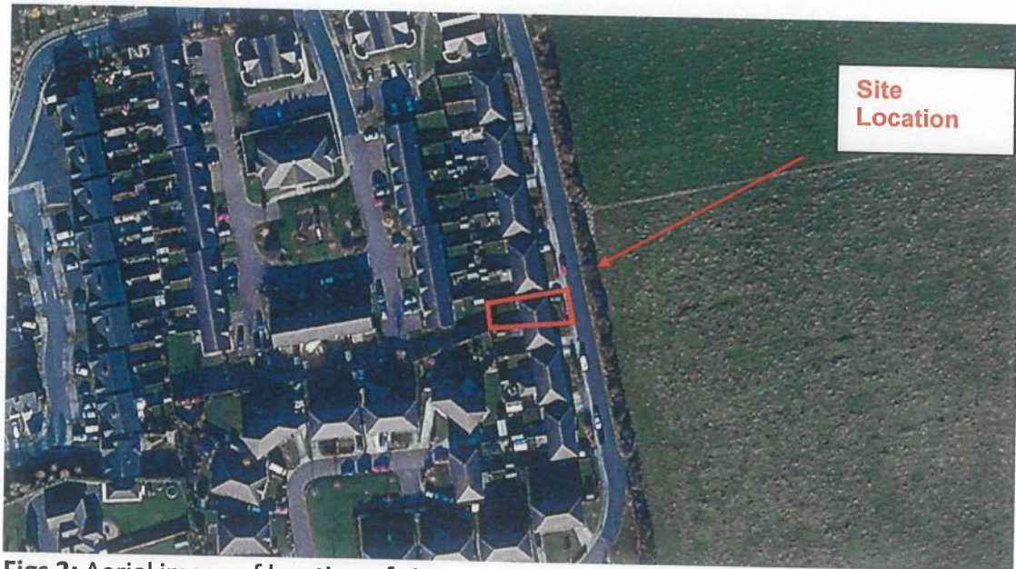
Figs 3: Aerial image of location of site