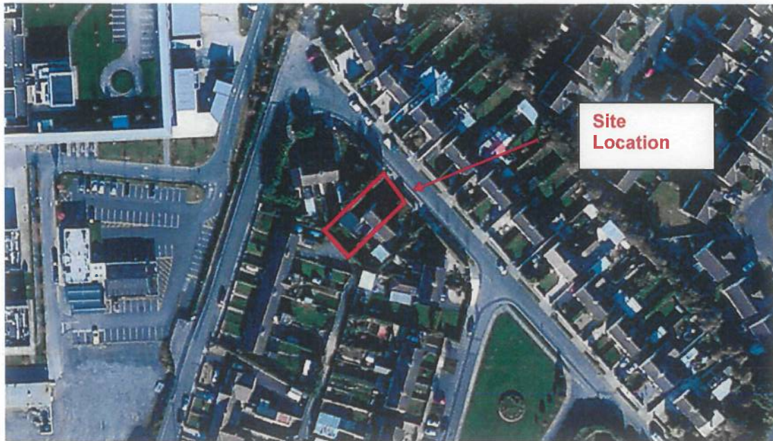
Figs 3: Aerial image of location of site