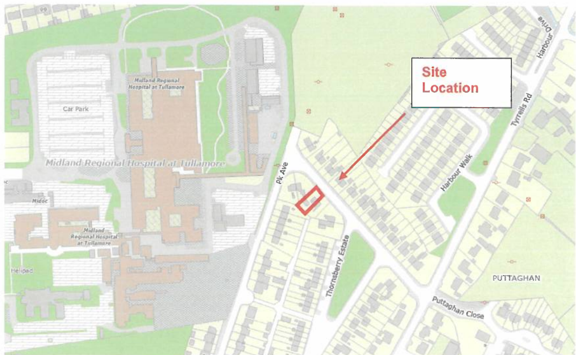
Figs 2: Site Location