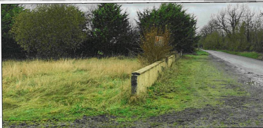
Photo 4 - Subject Site.