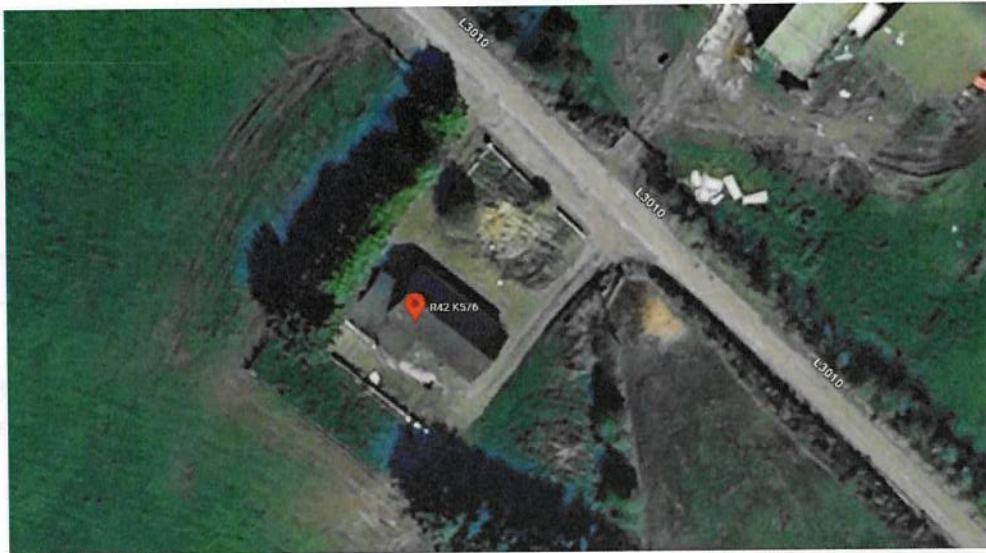
Photo 2 - Subject Site.