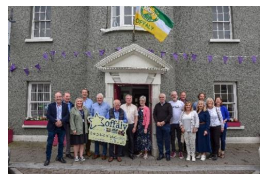
Pride of Place judges with Banagher Development Group members and Council staff at the Pride of Place judging event on 24^{th} July 2024.