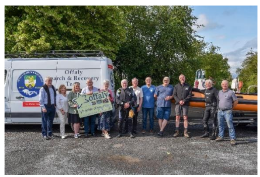
The Pride of Place judges meet members of Banagher Search and Recovery Team as part of the judging for Banagher Development Group on 24th July 2024.