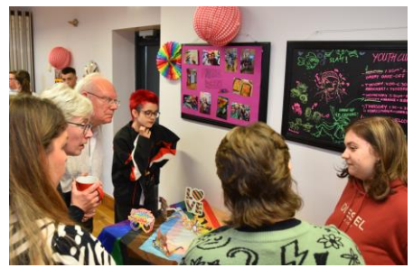
The Pride of Place judges meet members of the Acorn Project team who outline the range of activities undertaken at the centre