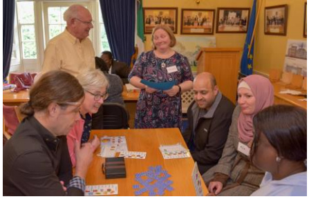
The Pride of Place judges meet families displaying activities they use in the Tullamore International Welcome Centre.