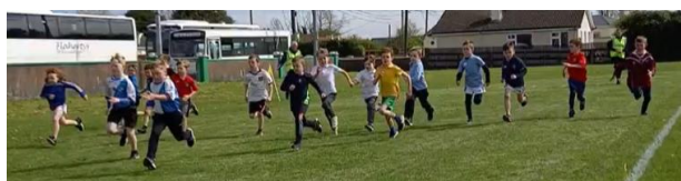
Action from the regional heats for the ACE spring athletics programme