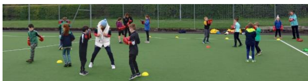
ACE Easter camp 2023

Easter saw the delivery of ACE multi-sport camp in the Tullamore Harriers for 40 children.