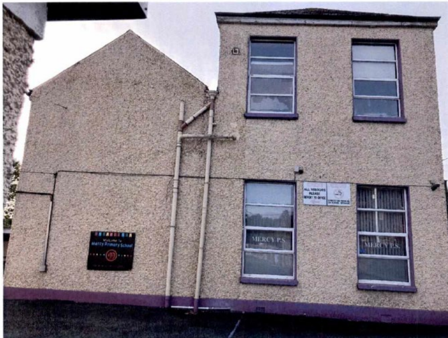
Figure 5 - Side (East) Elevation with uPVC windows.