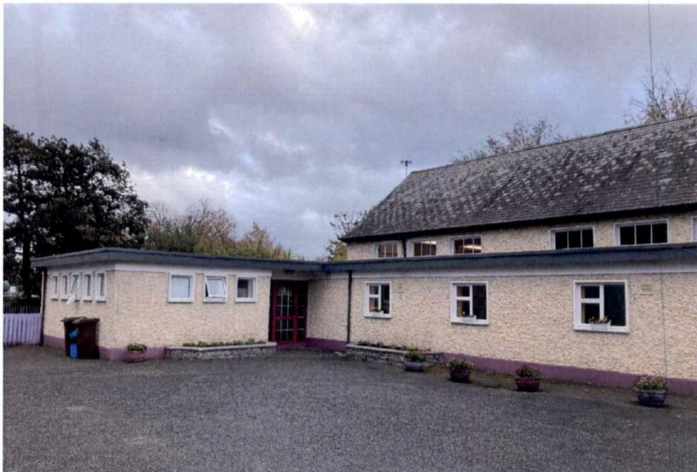
Figure 21 – Exiting Boyd Barrett-type building north elevation. The uPVC windows and old aluminium entrance doors are to be replaced with new double-glazed joinery made of thermally broken powder-coated aluminium.