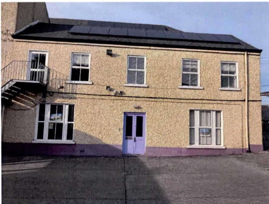
Figure 4 - Rear (South) Elevation - with uPVC windows and timber escape door.