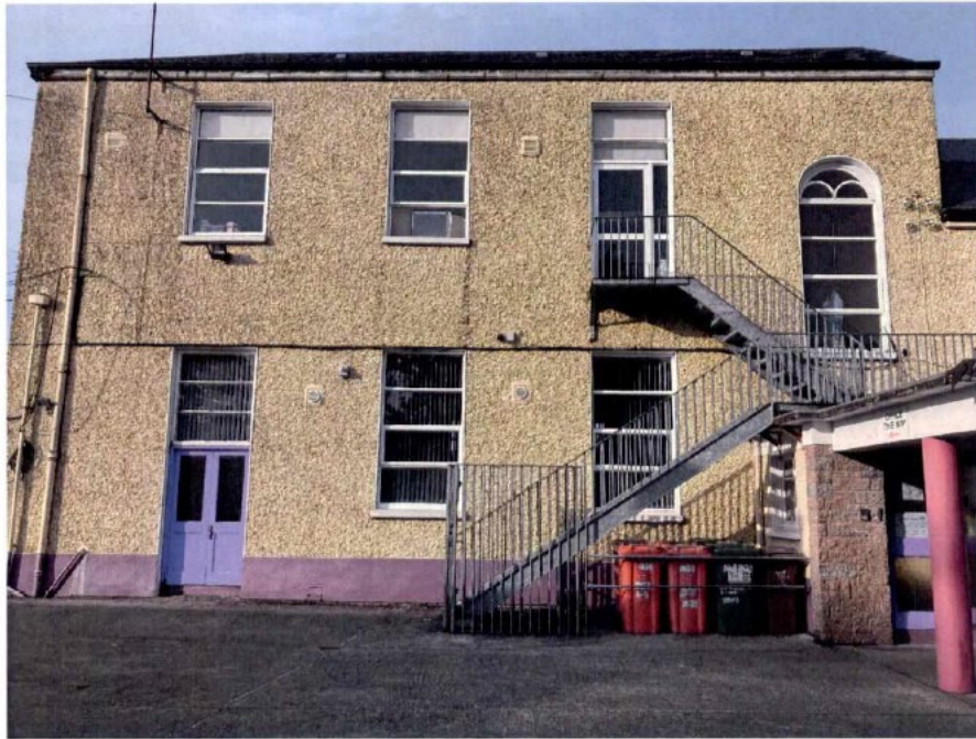
Figure 3 - Rear (South) elevation with existing uPVC windows and narrow doors.