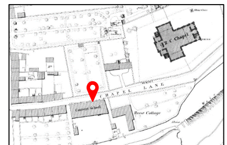
UCD Town Map 1879