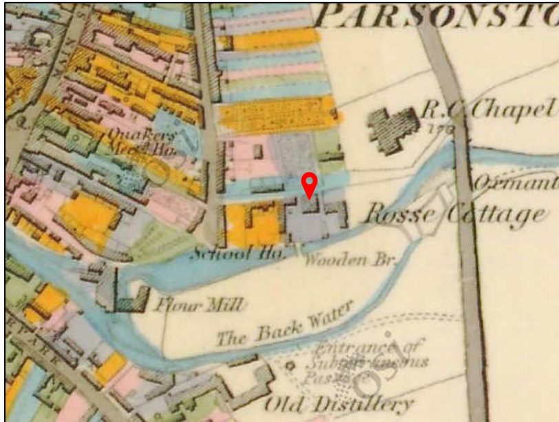
Historical 6" First Edition OS Map