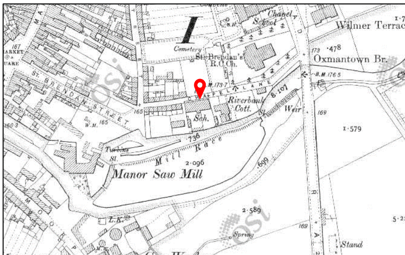
Historical OS 25 Inch Map (surveyed 1897-1913)