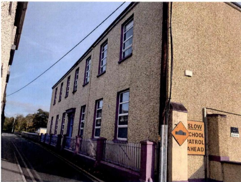
Figure 1- Front (North) elevation with existing uPVC windows and timber entrance door.