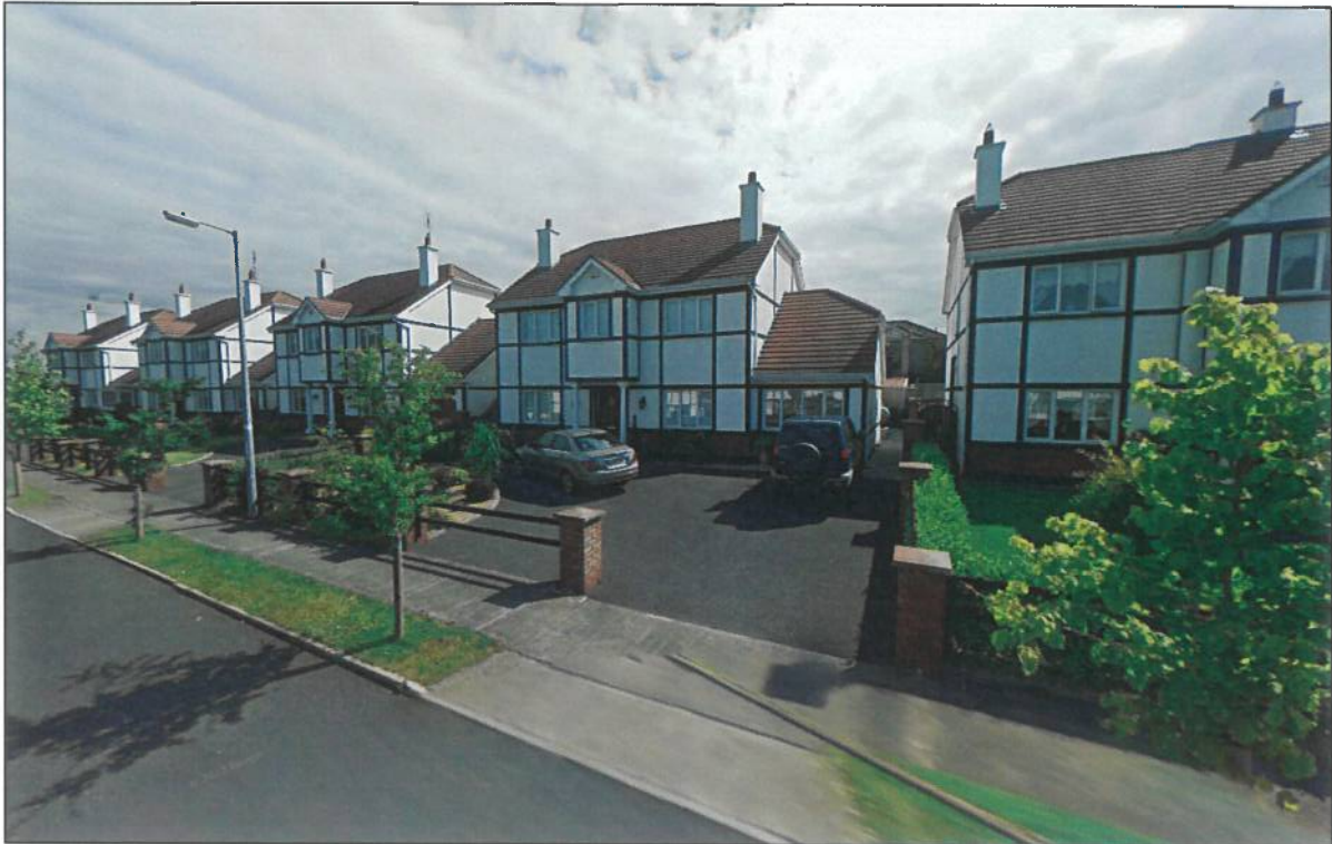
Photo 2 - Subject Site.

Adjoining Lands - No recent planning history associated with the adjoining lands.