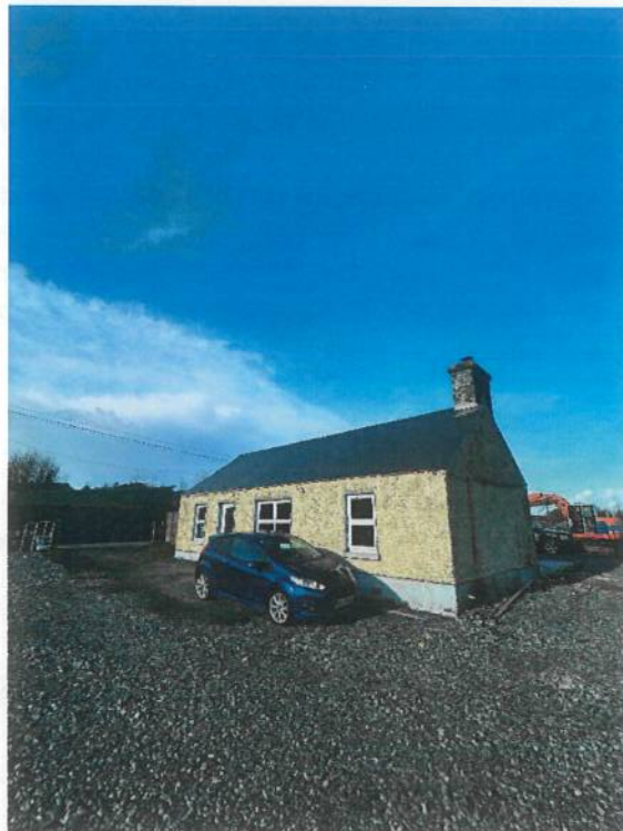
1. Subject Site

Located off a local secondary road, located on the site is an old cottage and farm shed. The property is surrounded by agricultural land, with a couple dwellings adjacent.