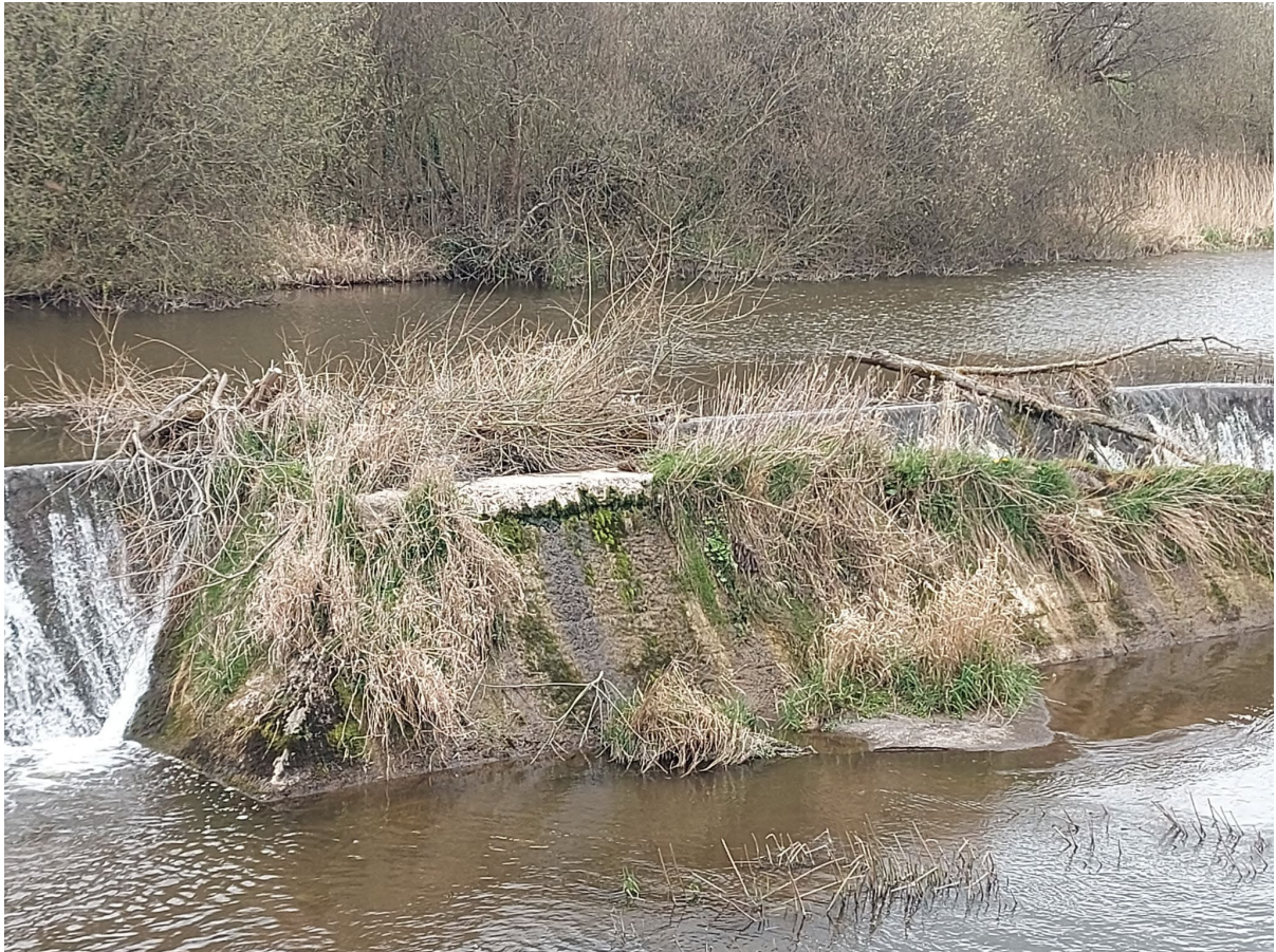
Visible stone sections