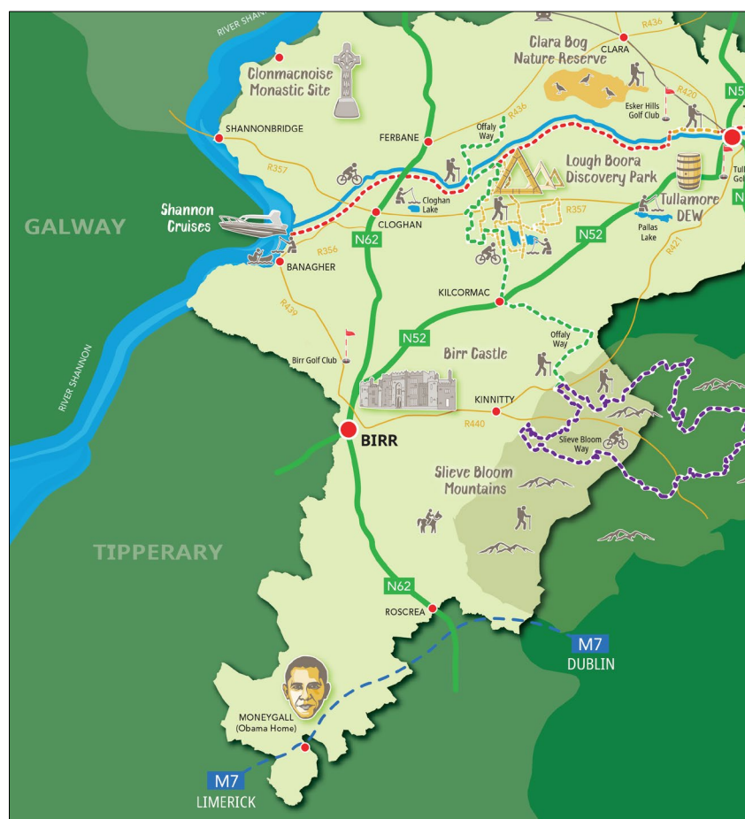
Figure 2.4 Regional Tourist Attractions in the vicinity of Birr

Tourism can play a key role as an economic driver for Birr with the town offering a range of attractions to both overseas and domestic visitors. The town is located in a central location within ‘Ireland’s Hidden Heartlands’ while also being situated in close proximity to a number of nationally and regionally important tourist attractions such as Lough Boora Discovery Park, River Shannon, Slieve Bloom Mountains and Clonmacnoise.