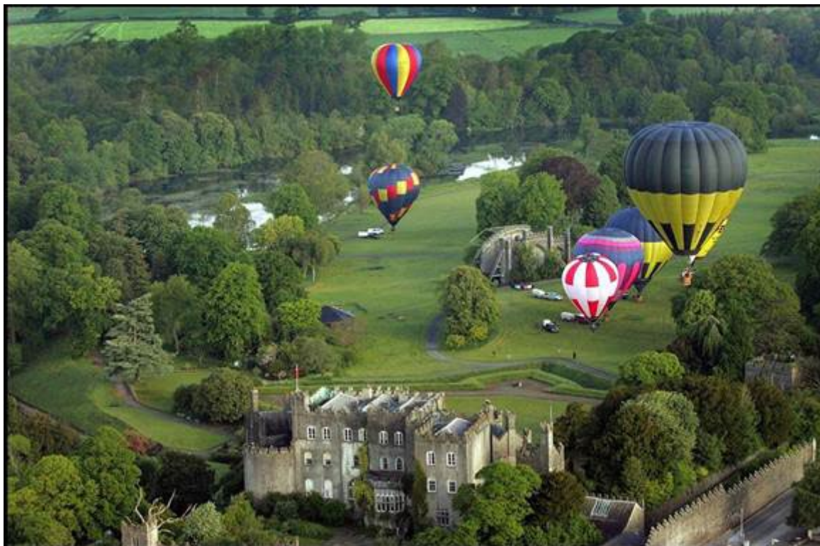
Figure 2.6 Irish Hot Air Ballooning Championships, Birr