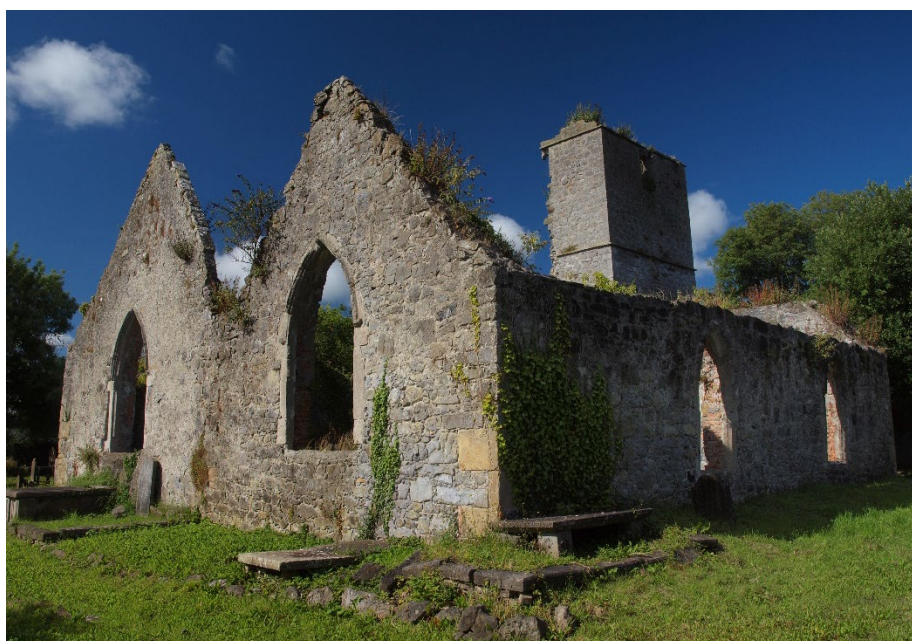
Figure 4.1 The Early Medieval Church ruins of St. Brendan, Church Street

Accordingly, this Plan will seek to manage and conserve Birr's heritage assets for the benefit of present and future generations. This plan also seeks to promote Birr's heritage assets as generators of economic development and urban regeneration while adhering to the relevant statutory obligations.