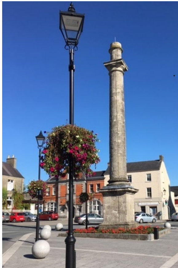
Figure 4.2 Cumberland Column, Emmet Square

The Council intends to protect all structures within the County Offaly Record of Protected Structures (RPS) that are of special architectural, historical, archaeological, artistic, cultural, scientific, social or technical interest. The County Offaly RPS accompanies the Offaly County Development Plan.