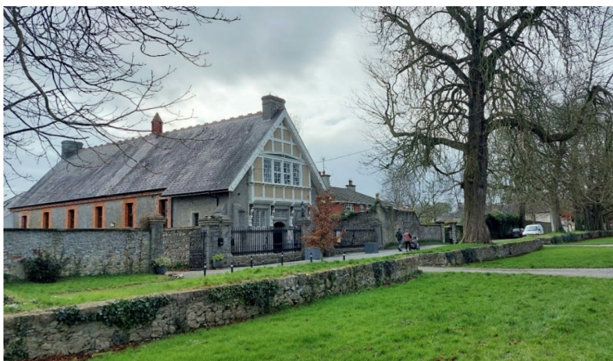
Figure 7.1 Birr Theatre & Arts Centre, Oxmantown Mall, Birr

Encouraging vibrant communities in Birr must start with offering residents a quality of life that opens new and different opportunities. Building communities should not retain focus on building homes only but build for the wider needs of the whole community and strive to develop communities that are well balanced, integrated, sustainable and well connected. Community services, facilities and amenities are needed at an early stage within the life of new communities to keep people engaged and invested. Equally important are the less visible types of support that make people feel at home in an area and create a sense of local identity and belonging, like volunteers, local committees or community development workers who by their passion and mobilization encourage involvement in shared community activities.