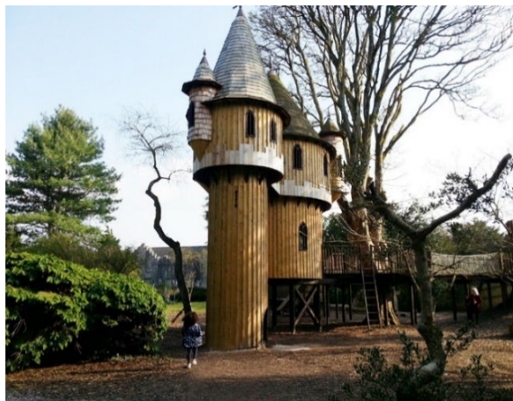
Figure 7.2 Tree House at Birr Castle Playground

Birr town and environs is served well by sports clubs with facilities for athletics, Gaelic Games, rugby, soccer, boxing, handball, tennis, gymnastics, swimming and gyms. Birr town also has a number of playgrounds and outdoor play areas. The public swimming pool and gymnasium is located at Townparks. The Council recognises the importance of this facility and will encourage and facilitate its continued development and enhancement.