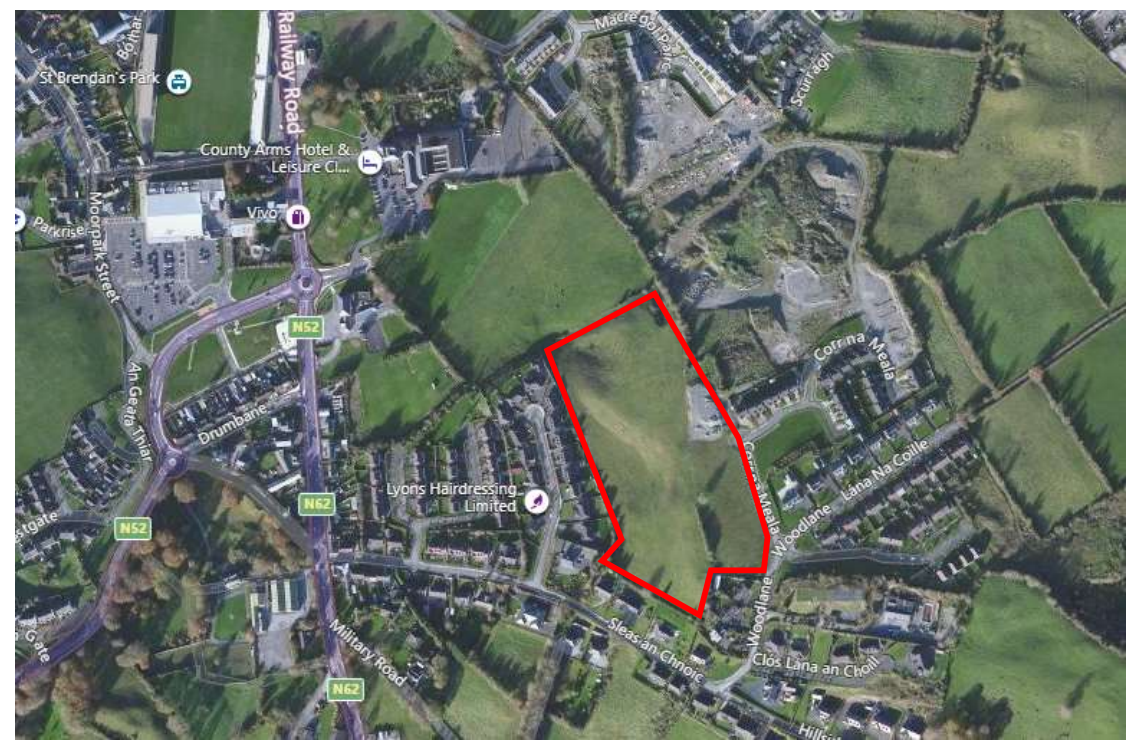
Figure 2.0: Aerial View of Subject Lands Indicative Outline in Red (Source: www.bingmaps.com).

The subject lands are currently greenfield in character and bounded to the south, west and east by existing established residential developments including the Hillside estate to the west and the Corr na Meala estate to the east. To the north, the subject lands are adjoined by agricultural lands to the North.