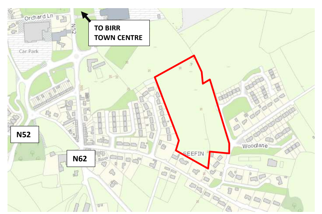
Figure 1.0: Site Location Map, Indicative Outline of Subject Lands Highlighted in Red

Our Clients are the owners of a c.4.5ha land parcel located in the townland of Seefin (see Figure 1.0). The purpose of the submission is to request that the land use zoning of this land parcel be changed from 'Strategic Residential Reserve', as is currently proposed in the Draft Development Plan to 'New Residential'.