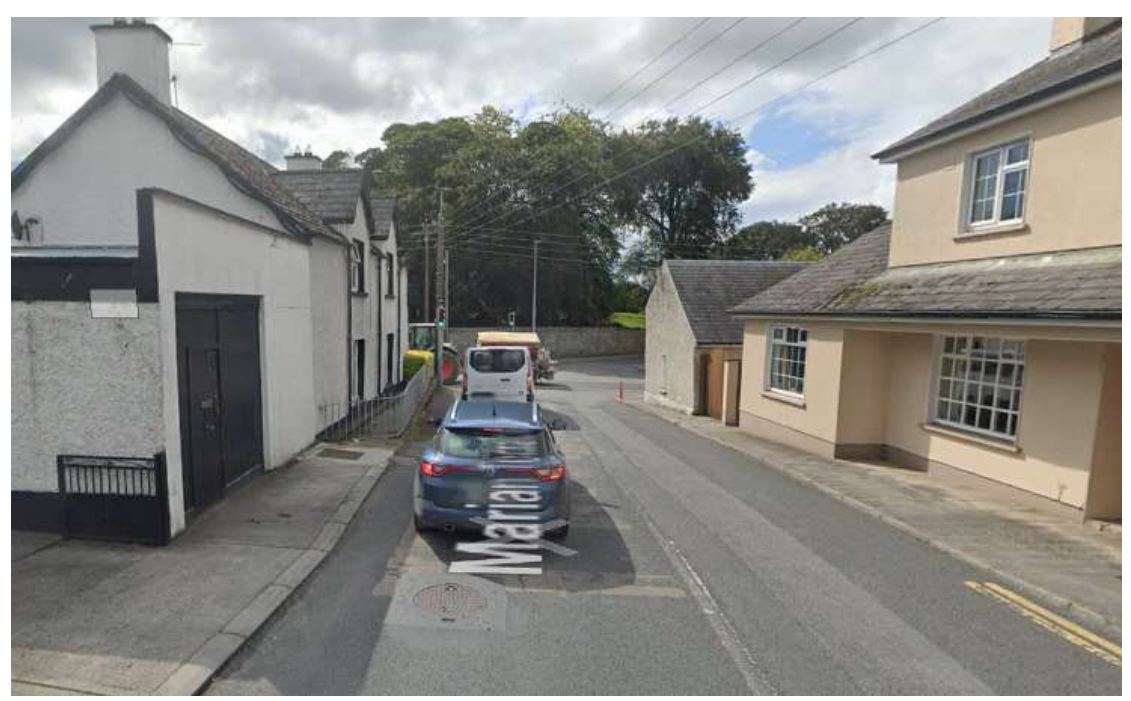
Figure 5.0: Junction of Marian Terrace and N62 which provides the primary connection between existing development to the south and the town centre

are not appropriate for vulnerable road users (see Figure 5.0). The future development of the subject lands would result in increased high quality connectivity between these areas and throughout the town as a whole by enabling access to the proposed distributor road to the north of the subject lands.