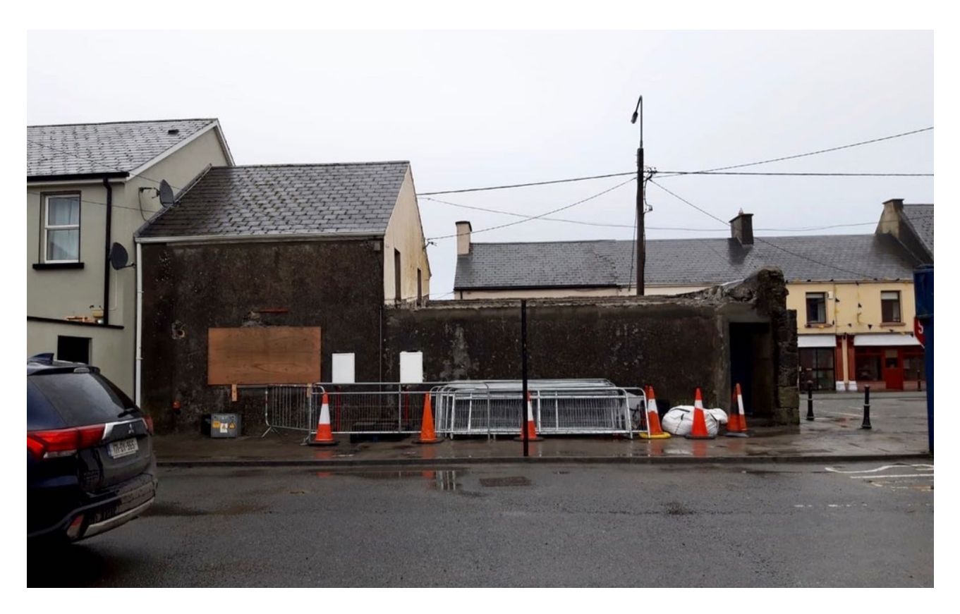
Plate 04: View from Crank Road car park (February, 2020)