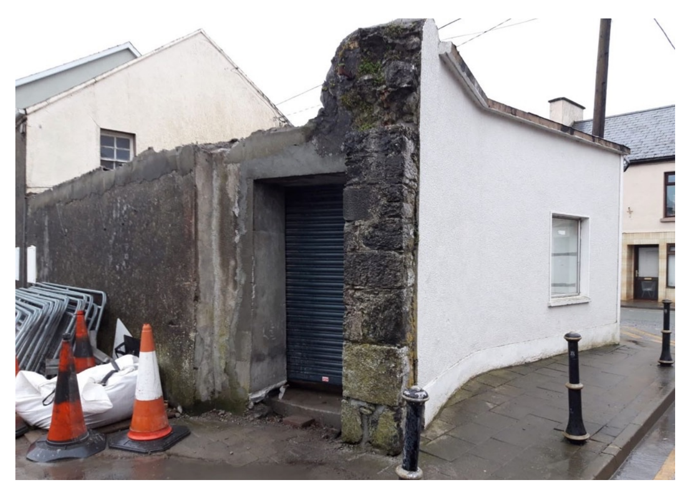
Plate 05: View from Crank Road of south gable with splayed detail in plan and evidence of former cut stone masonry arch and recent addition of door opening (February, 2020)