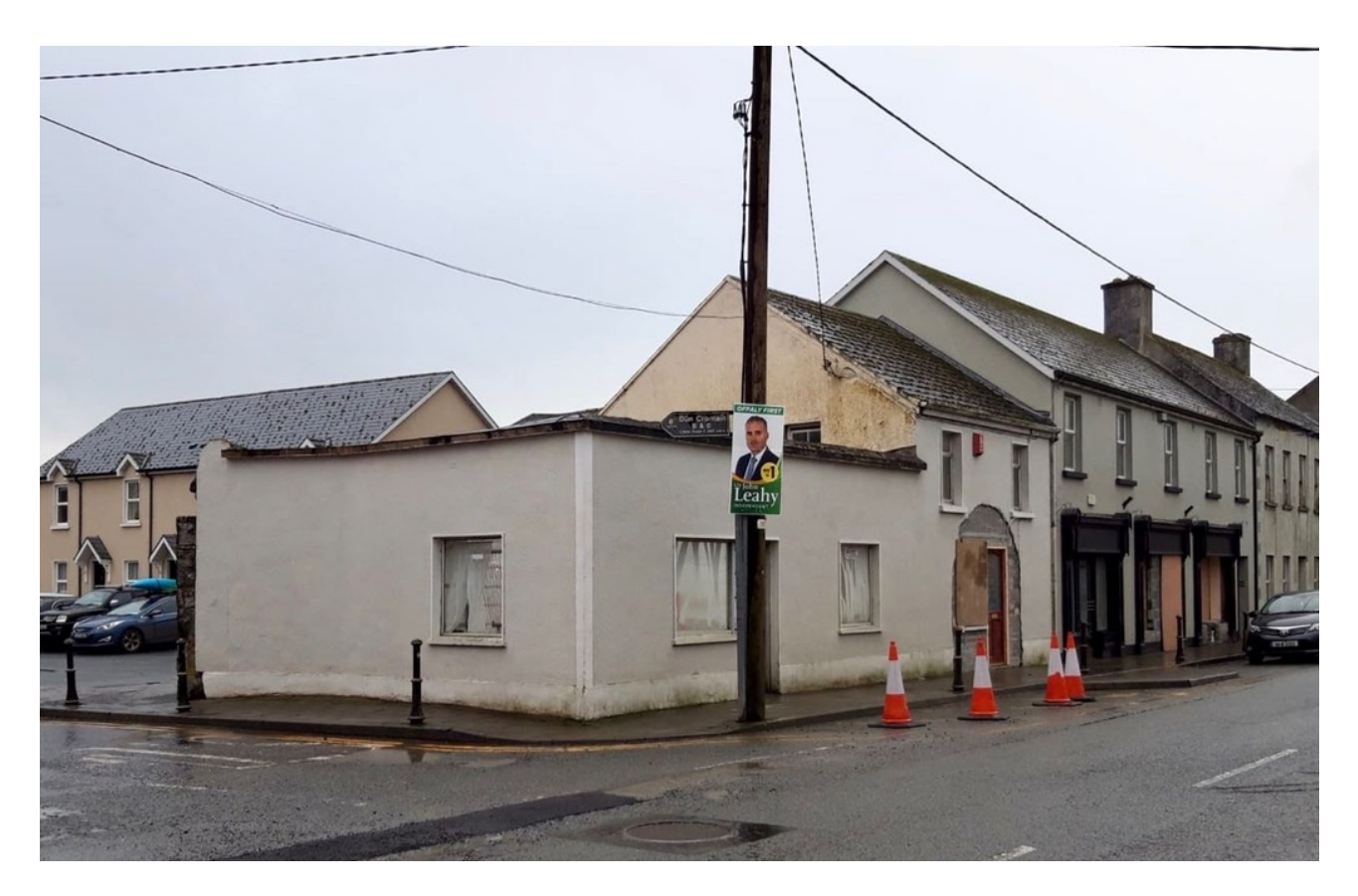
Plate 03: View from Main Street (February, 2020)