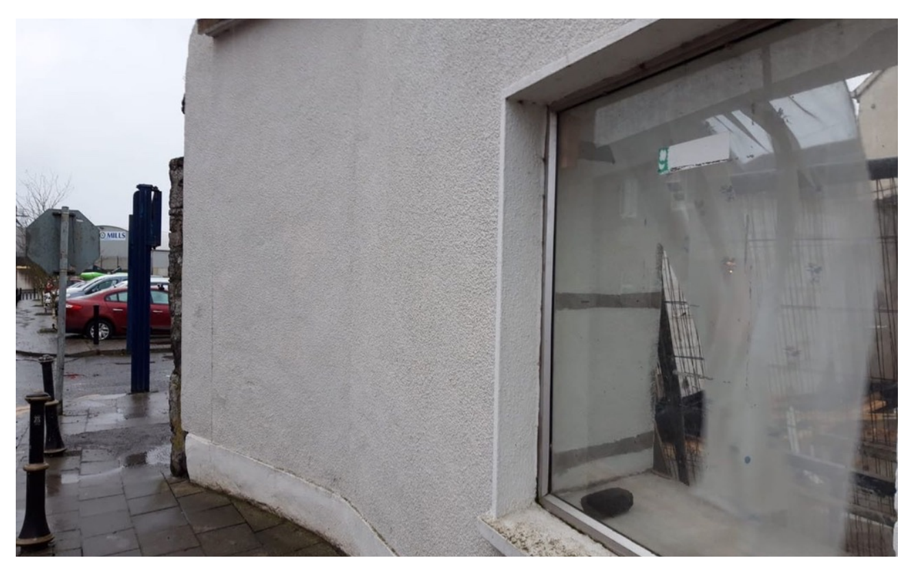
Plate 06: Detail of south gable facing onto Crank Road with splayed detail in plan and deep masonry construction as evidence by depth of internal window reveal (February, 2020)