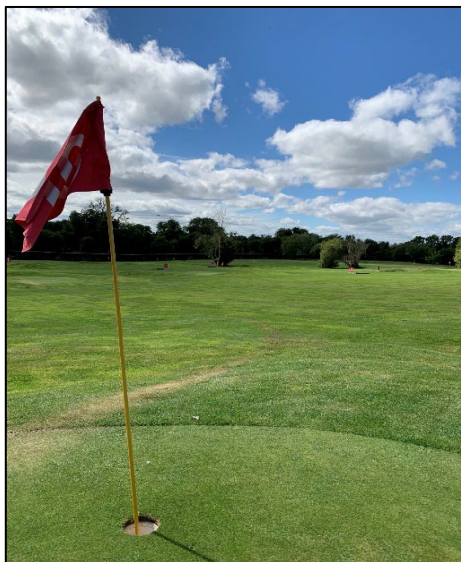
Figure 7.3 Edenderry Pitch and Putt

Significant progress has been made during the life of the Edenderry Local Area Plan 2017-2023 with the completion of the pitch and putt course, Skate Park, improved connections and the residential units overlooking the park.