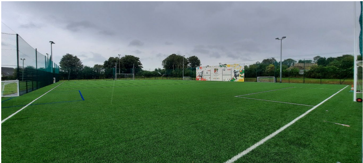
Figure 7.2 Astro and Ball Wall, Gaelic Park Edenderry

as ancillary car parking. Many of the existing sporting activities and facilities are located within the boundary of Edenderry Town in proximity to other services and are facilitated by footpaths, lighting and car parking. Offaly County Council will seek to promote and encourage all ranges of sporting activities in Edenderry that not only contribute to the town but to its wider hinterland also. Offaly County Council will encourage sporting clubs to expand or re-develop existing facilities and to maximise the usage of existing lands given over to the sporting activities associated with those clubs. Should a demonstrable need arise to re-locate clubs and their associated facilities, the Council would encourage their re-location to lands within the town boundary of Edenderry, within walking distance of residential areas and along well lit roads with footpaths.