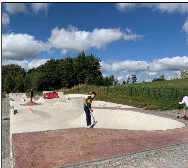
Figure 7.4 Edenderry Skate Park