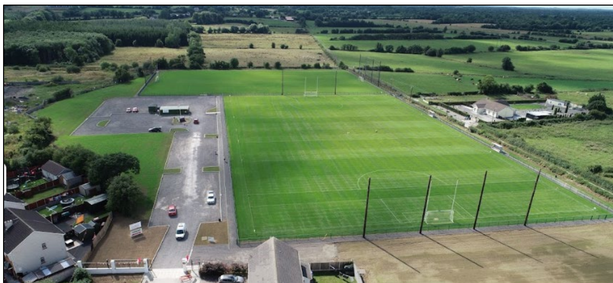
Figure 7.1 Edenderry GAA Grounds, Weavers Fields

Encouraging vibrant communities in Edenderry must start with offering residents a quality of life that opens new and different opportunities. Building communities should not be focused on only building homes but should be developed for the wider needs of the whole community and strive to cultivate communities that are well balanced, integrated, sustainable and well connected. Community services, facilities and amenities are needed at an early stage within the life of new communities to keep people engaged and invested in their locality. Equally important are the less visible types of support that make people feel at home in an area and create a sense of local identity and belonging. Volunteers, local committees or community development workers, by their passion and mobilization, encourage involvement in shared community activities.