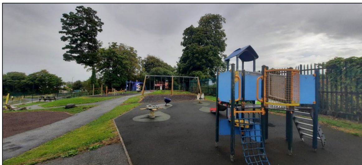
Figure 7.5 Edenderry Playground, Granary Court

The existing playground at Granary Court in the town centre was delivered under the Joint Playground Policy 2009-2013, in conjunction with Edenderry Community Playground Committee and OLDC. Continued effort and support is needed to integrate the playground fully and to maximise its use. The full re-development of Blundell Park amenities in close proximity to the existing playground and its proposed connections to the town centre will have benefits to the current playground in terms of surveillance and usage.