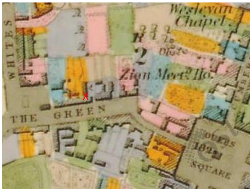
Historical 6" First Edition OS Map Site marked Red X

Note: Carriage Arch does not appear to be in place at this time.