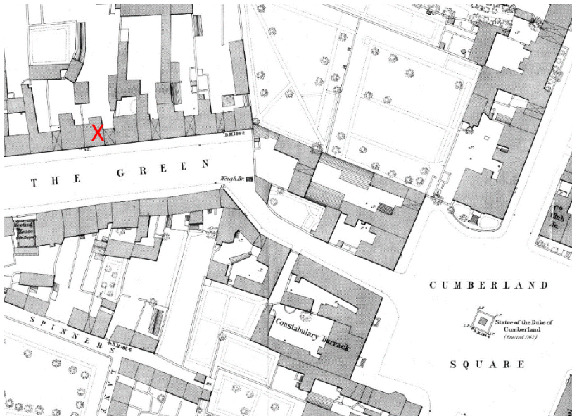
UCD Town Map 1879