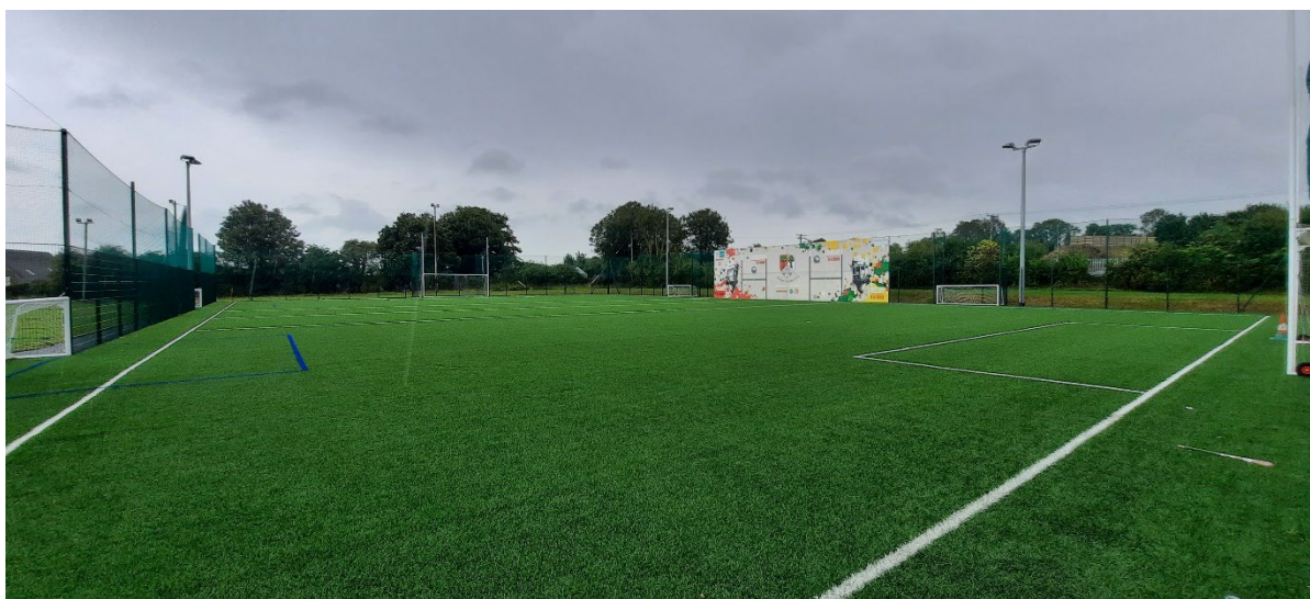
Figure 7.2 Astro and Ball Wall, Gaelic Park Edenderry

as ancillary car parking. Many of the existing sporting activities and facilities are located within the boundary of Edenderry Town in proximity to other services and are facilitated by footpaths, lighting and car parking. Offaly County Council will seek to promote and encourage all ranges of sporting activities in Edenderry that not only contribute to the town but to its wider hinterland also. Offaly County Council will encourage sporting clubs to expand or re-develop existing facilities and to maximise the usage of existing lands given over to the sporting activities associated with those clubs. Should a demonstrable need arise to re-locate clubs and their associated facilities, the Council would encourage their re-location to lands within the town boundary of Edenderry, within walking distance of residential areas and along well lit roads with footpaths.