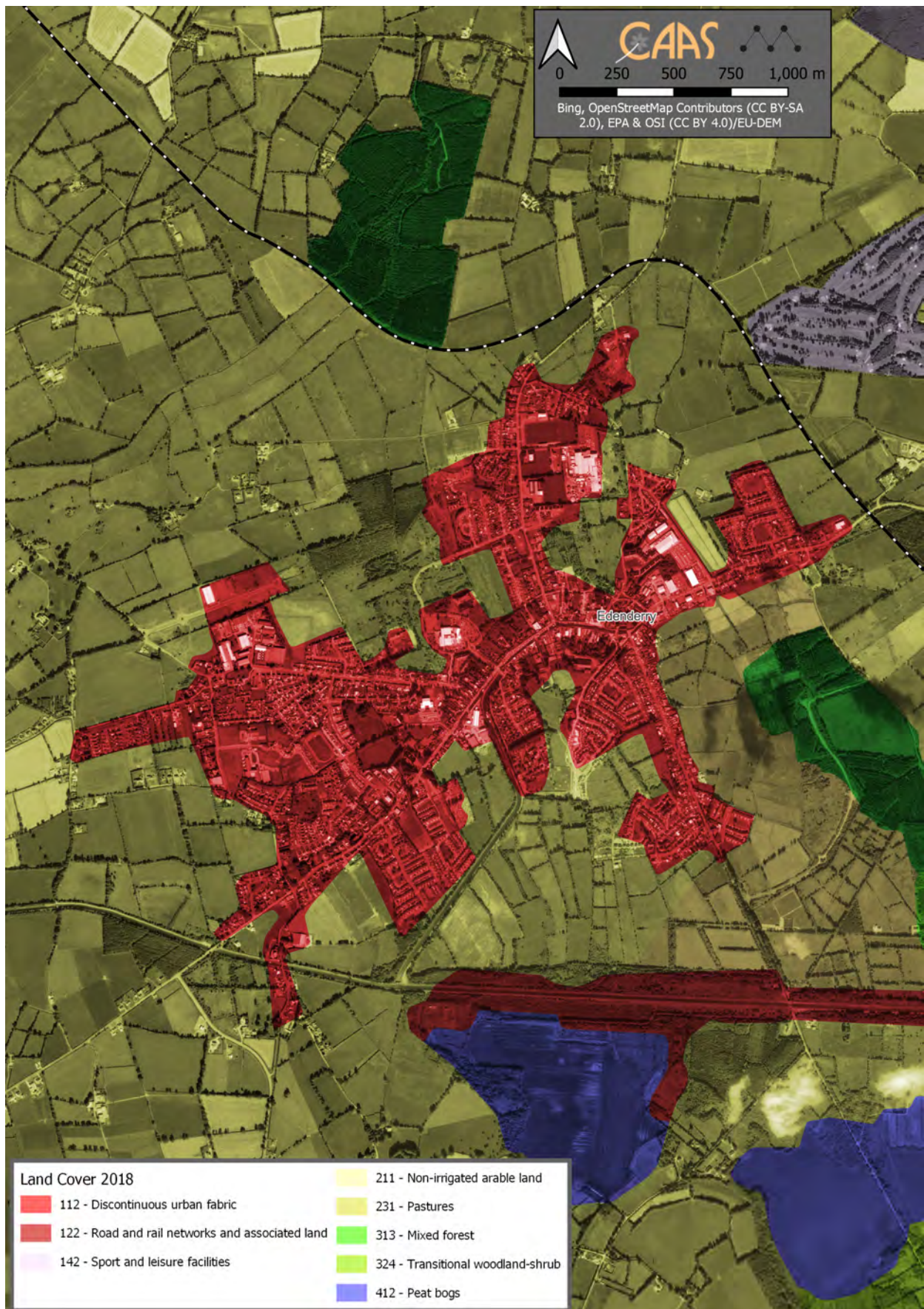
Figure 3.2 CORINE Land Cover Mapping 2018