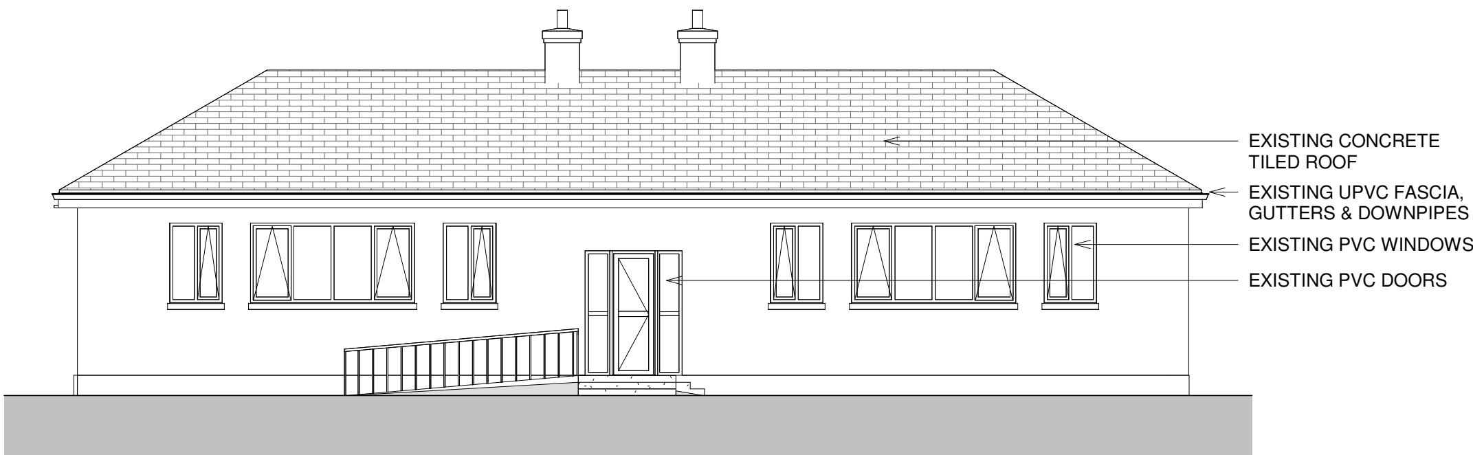
Existing South Elevation