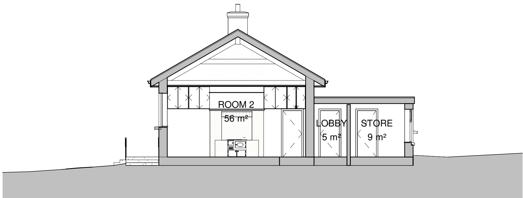
Existing Section A-A