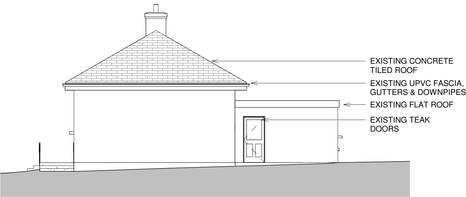
Existing East Elevation