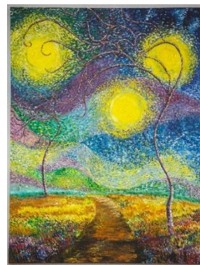
Daingean Landscape project

The 2019 Cruinniú na nÓg projects reflected the unique approach of the Creative Ireland team in Offaly, successfully optimising Arts, Heritage and Library synergies. The creative outputs of some remarkable projects will be on display and accessed by communities for years to come in public libraries around Offaly. These include a Swift Mosaic in Banagher Library, a Daingean landscape art piece in Daingean Library, Community Quilts in Birr and Edenderry Libraries and a music composition by Clara Youth Band.