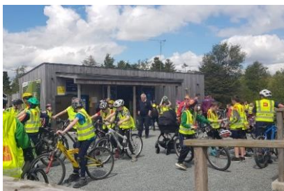
Bike Week School Cycle day at High Street NS