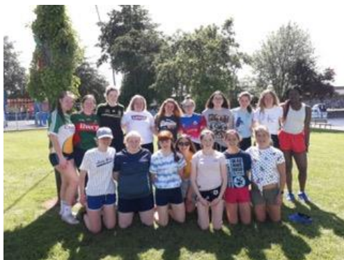
Community Coaching Programme for Young Women