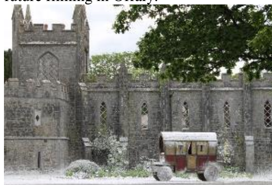
Charleville Covered in snow in May.

FilmOffaly – Two major film productions were on location at Charleville Castle, approximate spend in Tullamore each was over €500,000.00. FilmOffaly Award Script writing workshops were held with the shortlisted candidates. Several queries were made for film location packages for potential future filming in Offaly.