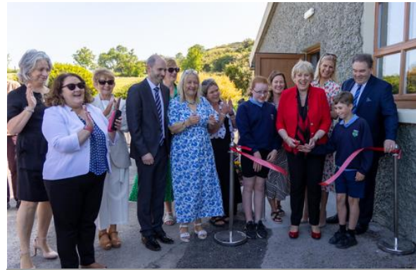
On 31st May 2023 Minister for Rural and Community Development, Heather Humphreys TD visited projects in Offaly