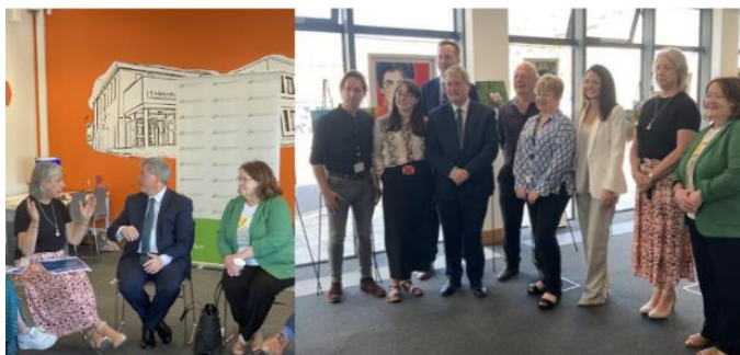
Tullamore Library staff were delighted to host Minister of State, Kieran O'Donnell, at the branch on Friday, June 2nd. The Minister spoke with elected members and senior OCC staff on housing initiatives and URDF funding, before touring Tullamore and Birr.