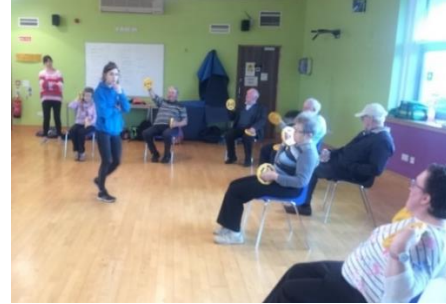
Action from Sports Inclusion Development Programme