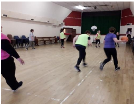
Action from the community sports development programme