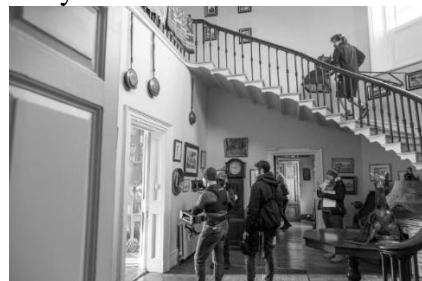
Wormhole in the Washer by local filmmaker—Padraic Keane on location at Loughton House Estate & Gardens

On Location - Two films were on location during November/December. The Arts office continued to support enquiries with regards location and information pertaining to FilmOffaly.