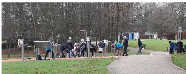
Action from the Healthy Choices, Healthy Community programme