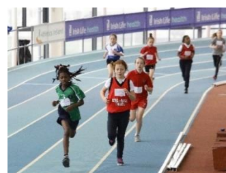
Action from Diversity Games

Primary diversity games took place on 23 rd January in Athlone – 441 pupils (52% Irish and 48% ethnic minority background) participated