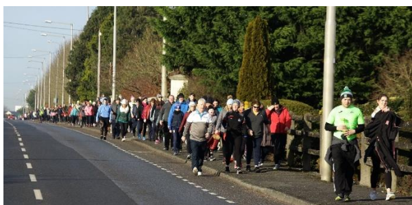
Action from the Operation Transformation national walk day