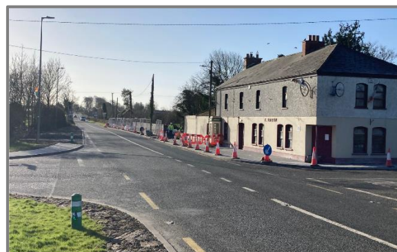
TII Safety Scheme enhancement works at N62 Doon Crossroads

Works are ongoing at the N62 Doon Crossroads since the beginning of the year following a successful application by OCC to the TII in 2021. The scheme is designed to significantly enhance the visibility at the R444/N62 crossroads when turning onto the N62 and also to prevent unsafe parking practices at busy periods near the public house on the crossroads. It is a high quality scheme design and will significantly enhance safety at the crossroads. OCC will continue to pursue finance from TII for other sites where significant safety concerns prevail.