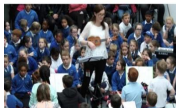
We love this! Ukulele Céilí is the new big music craze in Offaly