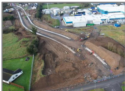
Drone aerial photograph of scheme under construction

Edenderry Town Inner Relief Road Works continue to progress well. Drainage works are complete. Ducting, Footpath & Kerbing works 90% complete. Junctions are now under development. Construction works to deliver the scheme will be ongoing into Q2 2022.