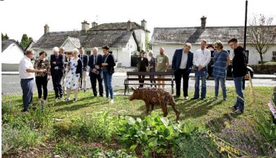
Geashill Creative Place Judging