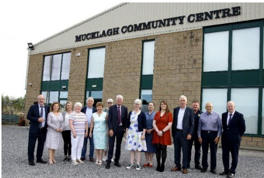
Mucklagh Community Centre