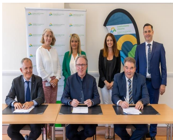
Pictured at the signing of contracts for Design Team Services for the new Community Library at Edenderry were: