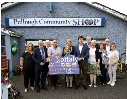
Pullough Village Judging event