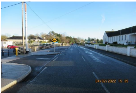
New Set down area at Frederick Street Clara