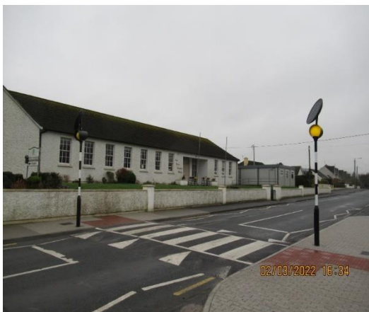
Upgraded Pedestrian Facilities at Frederick Street