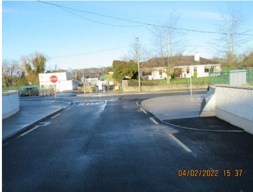
Junction Upgrade at the Station Road