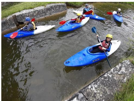
Edenderry Gaelscoil Éadan Doire