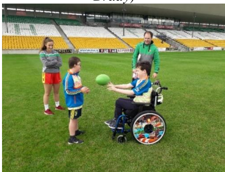
Rugby inclusion camp Inclusive GAA summer camp (in conjunction with Leinster Rugby)(in conjunction with Offaly GAA)