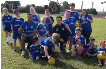
Summer soccer camps (Gary Seery)