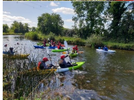
Urban outdoor adventure – Edenderry splash & dash with St Mary’s Secondary School