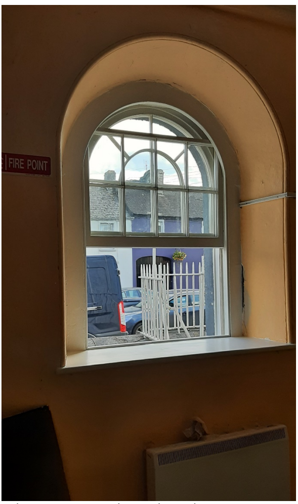
Entrance lobby with upper historic sash repaired, replacment lower section with matching glazing detail