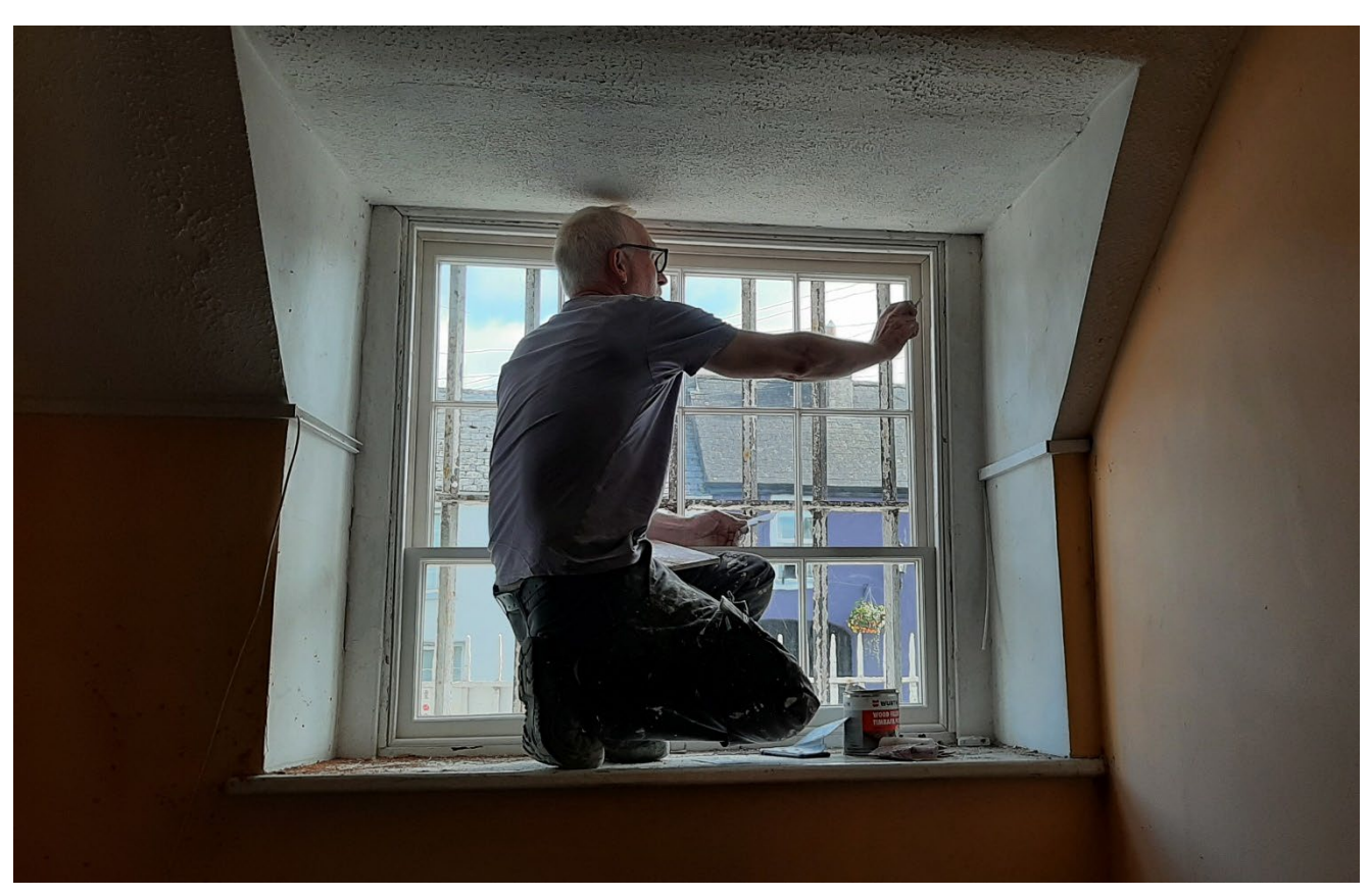
8/4 sash window and large courtroom sash – final coat of paint