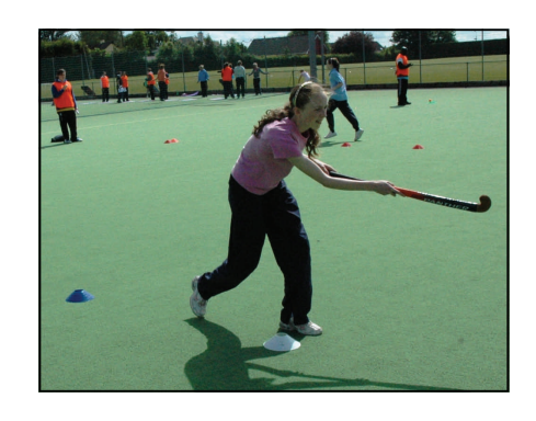
Three of the 10 challenges in the School Super Star programme - Gaelic solo, skipping, hockey dribble and shoot