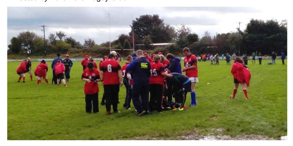
Tullamore Tigers competing at a local tag rugby blitz