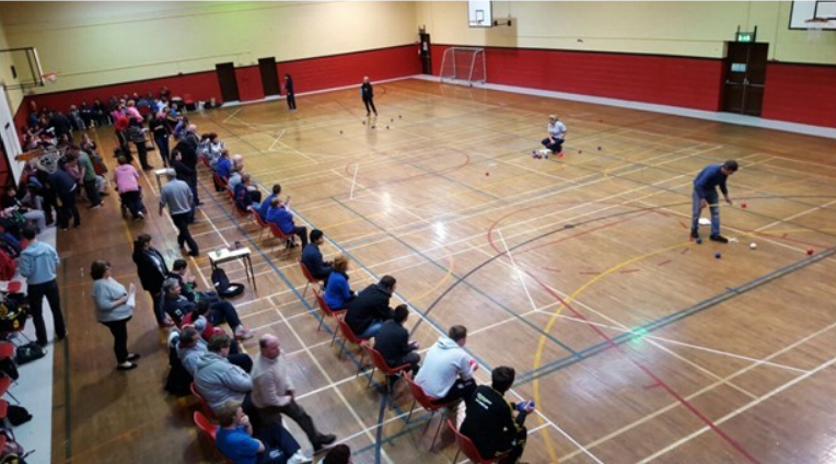
Sports Inclusion Development Programme activities (inter schools sports days & midlands boccia)