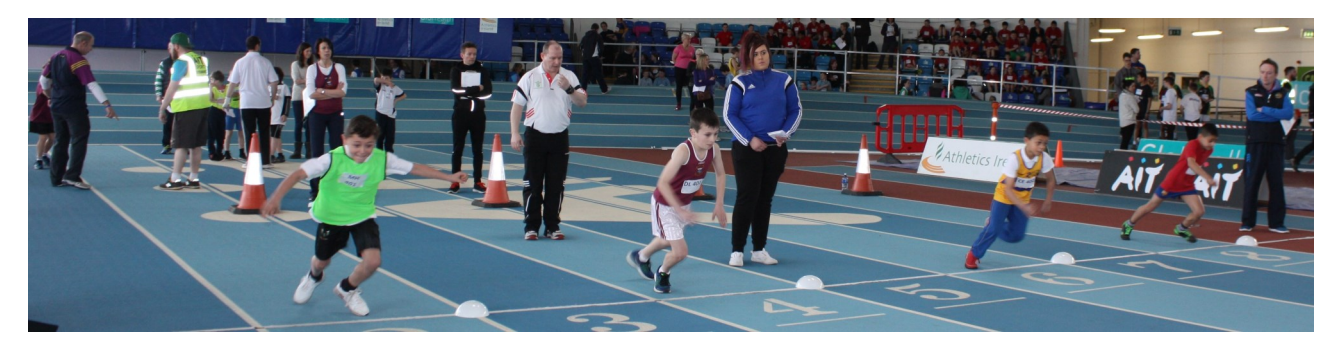
Participants racing in the 6th All Ireland SPORTSHALL Athletics Festival (primary)

The Partnership continued to coordinate the delivery of all aspects of the sixth All Ireland SPORTSHALL Athletics Festival on behalf of the wider sports partnership network in conjunction with Athletics Ireland and the Athlone Institute of Technology (AIT). 650 primary school pupils from across 14 counties