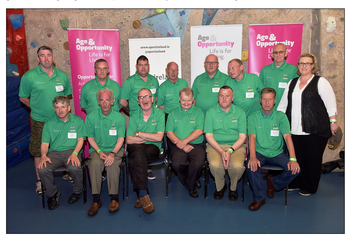
The Offaly team at the Go for Life Games 2016

Local leagues are organised by the Partnership and participants can qualify to represent Offaly at the annual National Go for Life Games. 50 older people participated in the local league with 12 going on to represent Offaly at the national games.