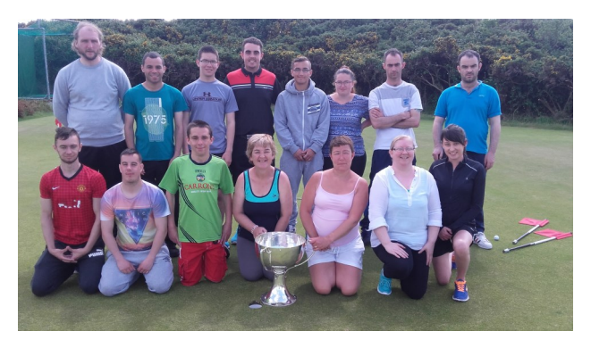
Participants from our Tullamore and Clara Community Coaching programmes

The Partnership also worked with Laois Spoors Partnership and Portarlington Leisure Centre to develop level 2 and 3 community coaching programmes with a focus on qualifications for the leisure industry.