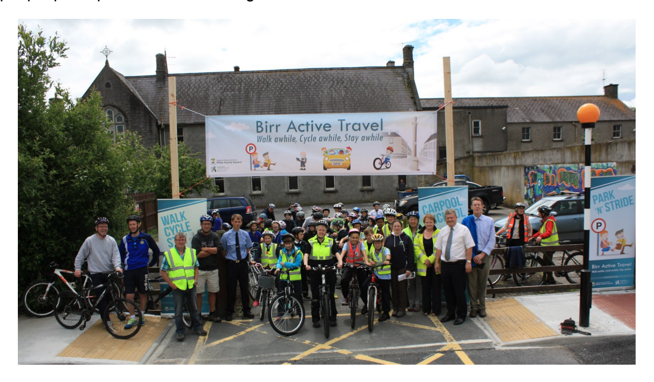
Participants of Offaly's Birr Lunchtime Cycle on Wednesday, 15th June 2016

Offaly Sports Partnership in conjunction with Offaly County Council, the HSE and An Taisce delivered a range of cycling events for primary school pupils; and supported clubs to deliver junior cycling events in Birr, Ferbane and Tullamore. 300 children and young people participated across the range of activities on offer.