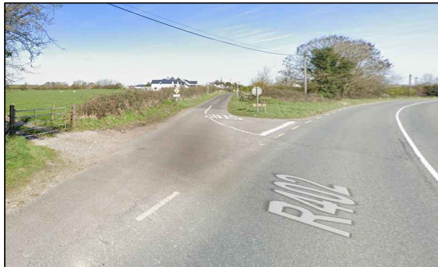
IMAGE OF EXISTING ROAD LAYOUT - MOUNT LUCAS SIDE