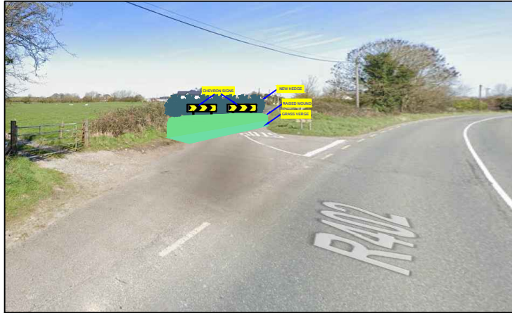
IMAGE OF PROPOSED CUL DE SAC LAYOUT - MOUNT LUCAS SIDE